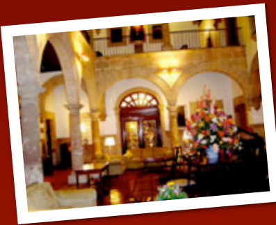
The Virrey de Mendoza, our hotel in Morelia

Looking for an escape with delightful people, a vacation in one of Mexico's most charming areas, and a huge leap in your skill with Spanish?